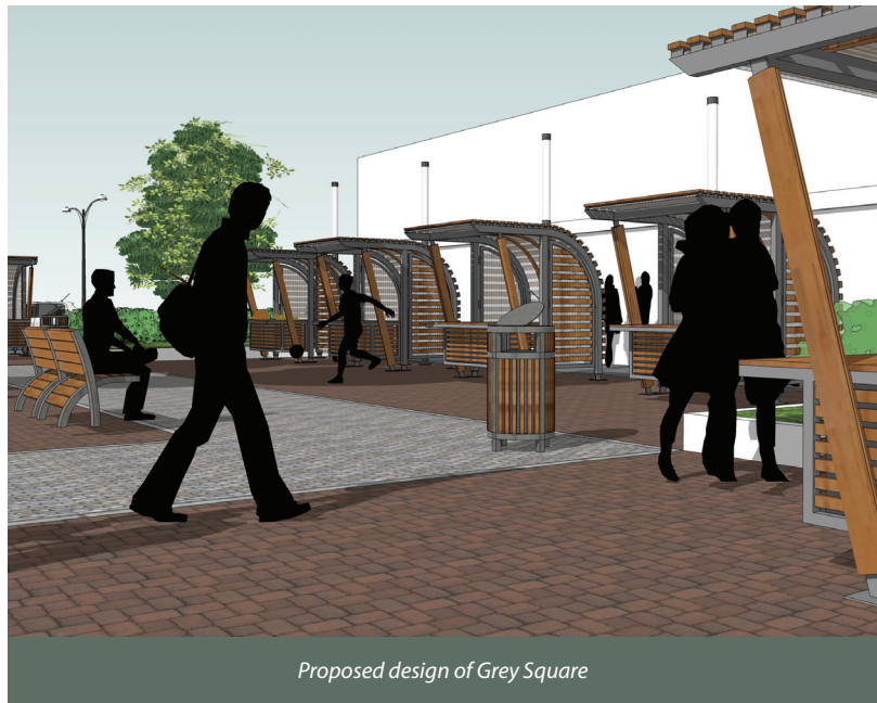
Proposed design of Grey Square

The construction of a new bridge and road linking Stutterheim town and Mlungisi is complete and open for traffic. Final clearance of the site is underway and new street lights have been ordered to increase pedestrian safety at night. A pedestrian walkway leads all the way up to Mlungisi to promote safe walking. The bridge having being entirely built out of bricks in an old style to maximize the use of local labour during construction, is a new beautiful feature in town.