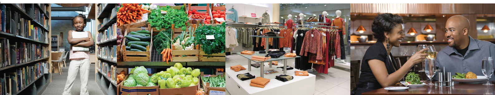
The Community Commercial Park will provide a variety of services to Mlungisi residents.

Looking forward, these initiatives will change the face of Stutterheim and its surrounds for both residents and visitors alike, aiming to live up to the town's brand – PURE PLEASURE .